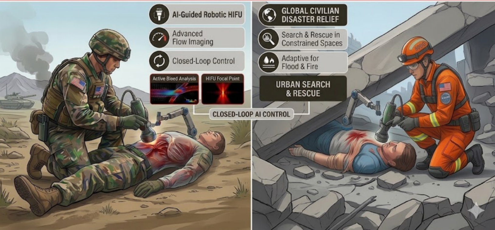
Conceptual Render: AI-Guided Robotic Hemostasis

STOPPING NON-COMPRESSIBLE HEMORRHAGE IN EXTREME ENVIRONMENTS